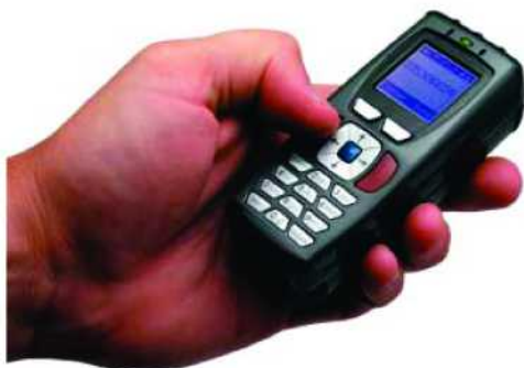
The CR3 will instantly decode all bar and 2D codes

Code eliminates the need for costly, high-overhead operating systems by providing an open platform JavaScript development environment within its CodeXML Applications Development Suite. With CodeXML and JavaScript, developers and Information Technology organizations no longer need to worry about expensive porting of applications between Windows, Windows Pocket PC, Windows CE.Net, et.al.. A unique feature of the Applications Development Suite is the ability to protect both development investment and data security by a customer-unique key encryption, which allows the developer to control the distribution and modification of applications to specific serial-numbered CR3 units. Code offers an easy to use tool for creating complete data collection applications for the CR3, without programming. You can design menus and input screens, control scanning and keypad entry, use look-up tables to validate input and send data to and from the CR3. All with a "point and click" interface on your windows PC.